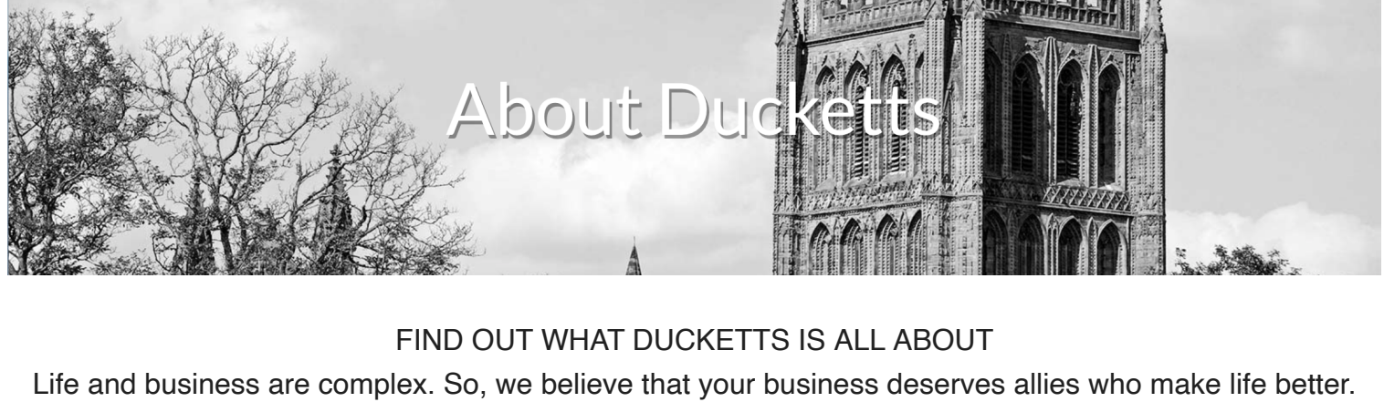
Ducketts are a firm of proactive Chartered Accountants and Growth Specialists who want to help our clients meet their aspirations. We want to make sure we focus on the issues that are important to you and demonstrate that our real value is in helping your business to succeed and grow.